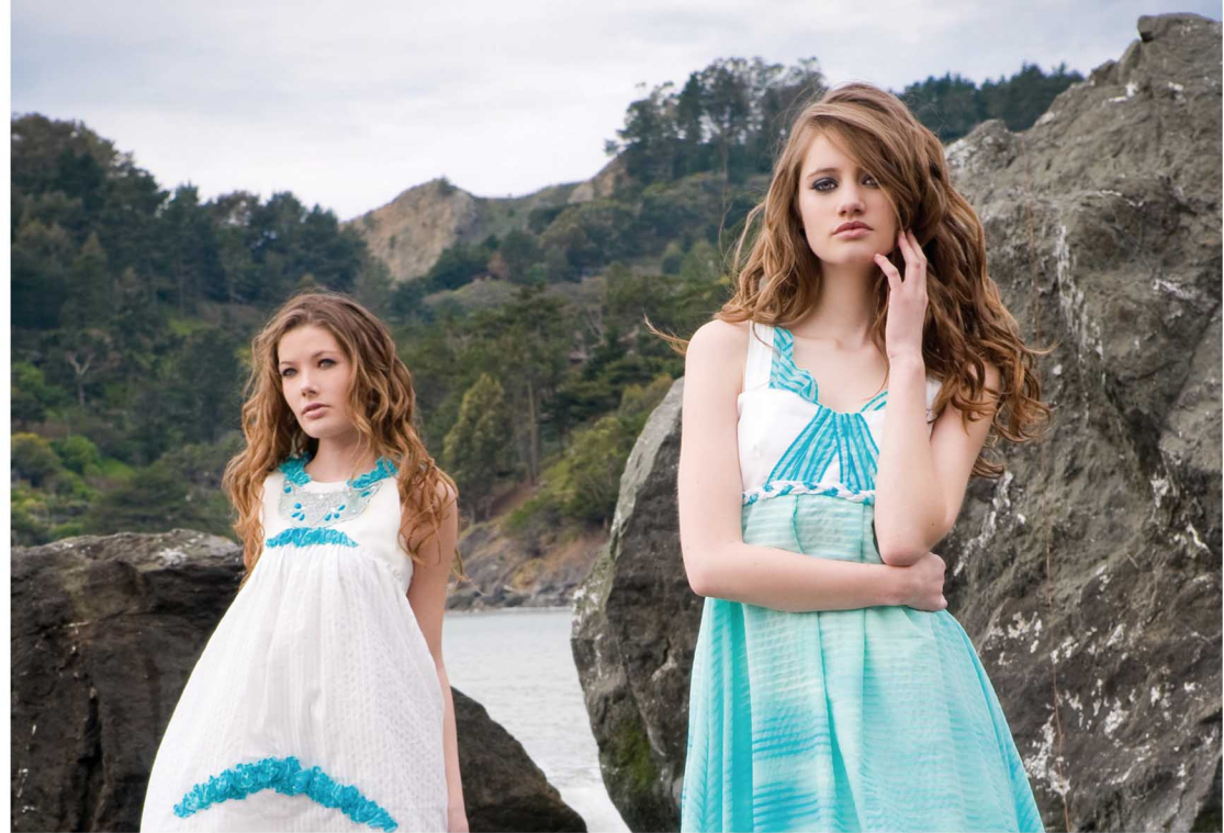
(Top Left/Bottom Left) Celestial Dress #SC1001B (Opposite Page/Top Right) Helena Dress #SC1002B (Bottom Right) Daphne Tunic #SC1003OR