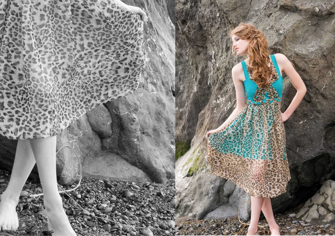
(Top Set) Priscilla Dress #SC1011LP (Bottom Set) Eliza Dress #SC1012P (Opposite Page) Cordelia Dress #SC1010M