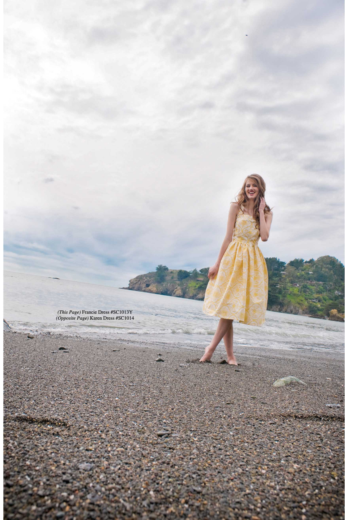
(This Page) Francie Dress #SC1013Y (Opposite Page) Karen Dress #SC1014